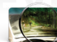
Polarized Rx lens introduced